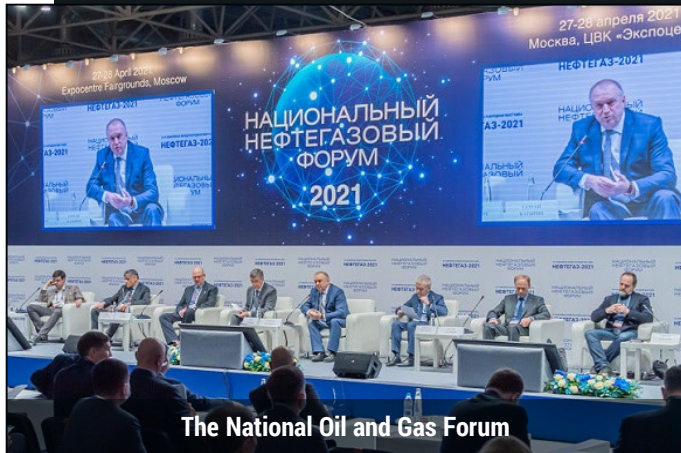
The National Oil and Gas Forum

A wide range of industry congress events that create a unique business atmosphere for networking, communication, presentation and promotion of sophisticated solutions