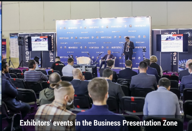
Exhibitors' events in the Business Presentation Zone