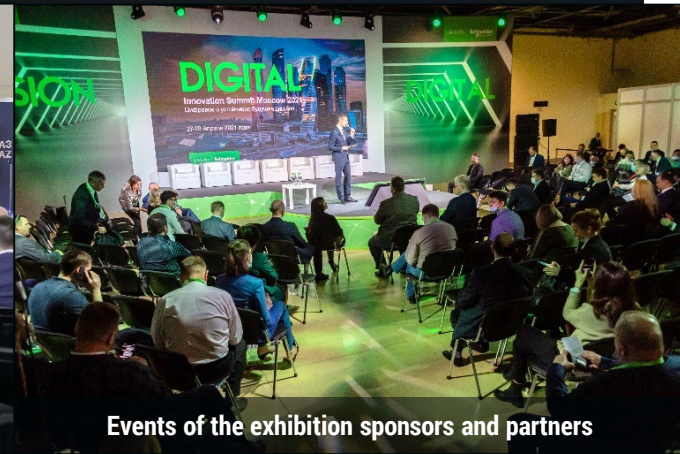
Events of the exhibition sponsors and partners

68% of visitors attended the conference programme