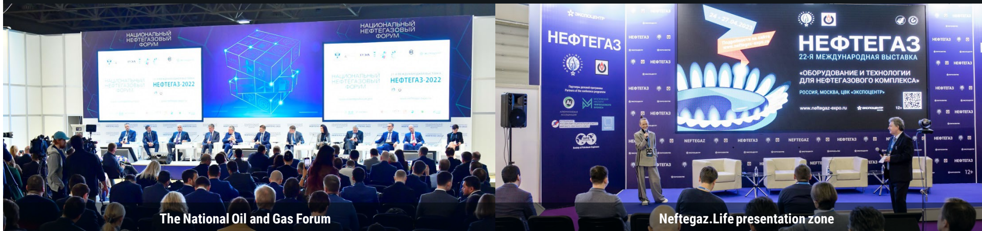
The National Oil and Gas Forum

A wide range of industry congress events that create a unique business atmosphere for networking, communication, presentation and promotion of sophisticated solutions